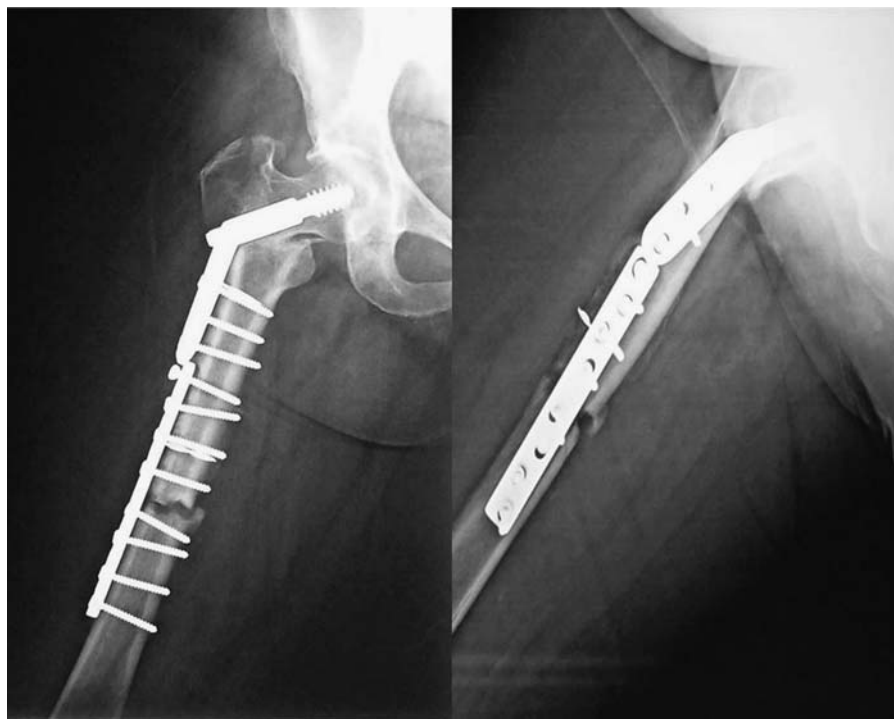
FIGURE 2. Anteroposterior and lateral radiographs of the right femur 13 mo postoperatively. Atrophic nonunion of the diaphyseal fracture, malunion in the trochanteric area, loosening of two proximal screws and two broken drills inside the medullary canal.