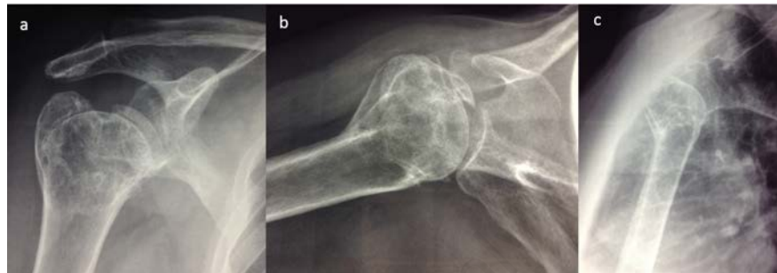
Figure 2. Malunion and tuberosities displacement in a 44 years-old female patient after conservative management of a 4-part valgus impacted fracture treated conservatively in another hospital. The patient has 145 degrees of forward elevation, limited external rotation and Constant score 65.

We performed analytical search of PubMed, Embase, Web of Science, Google Scholar and the Cochrane Library, restricting it to the years 1991-2014 (December). The query was 4-part fractures of proximal humerus or 4-part fractures or valgus impacted fractures or 4-part valgus impacted fractures or fractures with valgus impaction or C1.1, C2.1 proximal humeral fractures. In addition we searched combina-