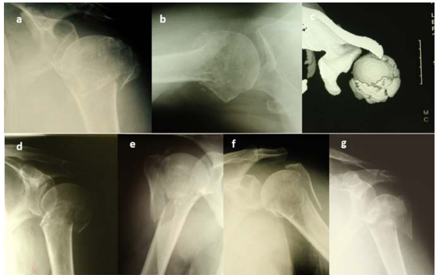
Figure 1. a-c) Typical example of 4-part VI fracture in two radiographic planes (a) anteroposterior and (b) axillary; c) computed tomography scan showing the spread of both tuberosities and the impaction of the humeral head. d-g) Other examples of 4-part valgus impacted fractures with different degrees of humeral head impaction and tuberosities displacement.

To our knowledge, a systematic review of LPFT in the management of 4-part VI fractures of the proximal humerus has not been per-