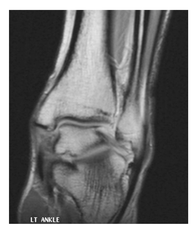
Fig. 2. Coronal MRI image demonstrating the ATFL ligament with increased signal.

Examination and stress fluoroscopy to assess talar tilt was performed under general anaesthesia. It was then repeated on the contralateral (uninjured) side. The anterior drawer translation was measured on the lateral stress