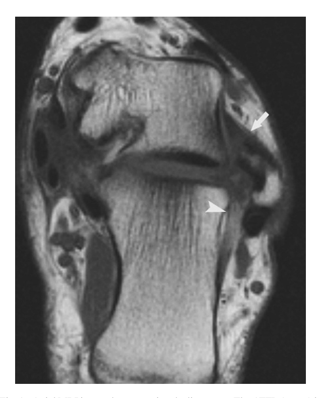
Fig. 1. Axial MRI image demonstrating the ligaments. The ATFL (arrow) is discontinuous and irregular. CFL (arrowhead) is of diffusely increased signal anteriorly.

Pre-operatively, a detailed history was obtained and a thorough clinical examination was performed. Plain radiographs (antero-posterior and lateral views) were obtained to exclude bony abnormalities. All 58 patients had pre-operative MRI scans of the injured ankle, in an attempt to evaluate injury of the ATFL, CFL and deltoid ligaments. These scans were reported on by a senior musculo-skeletal radiologist. Criteria used to diagnose ligament tears included lack of visible ligament, ligament irregularity and thickening and heterogeneity of ligament signal (Figs. 1 and 2). Our radiologist also reported on the presence of cartilage lesions, bone bruising and peroneal tendon tears. Scans were performed on a Philips Intera 1.5 T MRI scanner using a quadrature knee coil. The foot was imaged in 20-30° plantar flexion. Sagittal T1 and STIR (3/0.3 mm), Axial T1 and T2 (3-4/0.3-0.4 mm), Coronal T2 and usually T1 (3-4/0.3-0.4 mm).