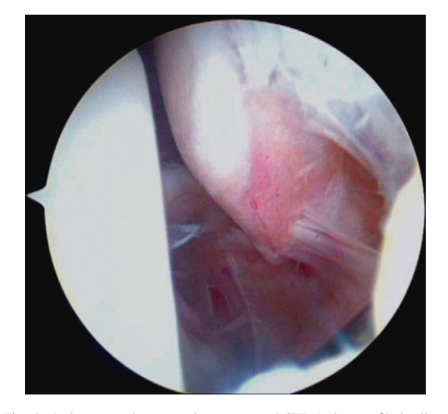
Fig. 5. Arthroscopy demonstrating a ruptured CFL (calcaneo-fibular ligament).

Arthroscopy was performed under ankle traction with a Guhl ankle distractor (ACUFEX, Smith & Nephew, Inc., Andover, MA) with a standard 4.5 mm cannula and arthroscope through an anterolateral, anteromedial and antero-central portal in each patient. The integrity of the lateral ligaments and other intra-articular lesions were identified, if present, and documented. Loss of integrity was diagnosed if there was avulsion, mid-substance tears, attenuation or elongation of the ligaments. The sensitivity, specificity, accuracy, positive predictive value (PPV) and negative predictive value (NPV) were calculated for the MRI and for stress views and were compared with the arthroscopic findings for the integrity of the CFL and ATFL (Figs. 4 and 5).